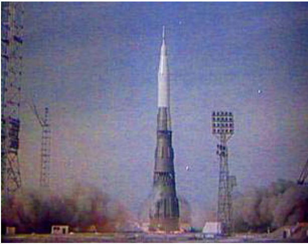
Launch of 3-L on February 21, 1969.