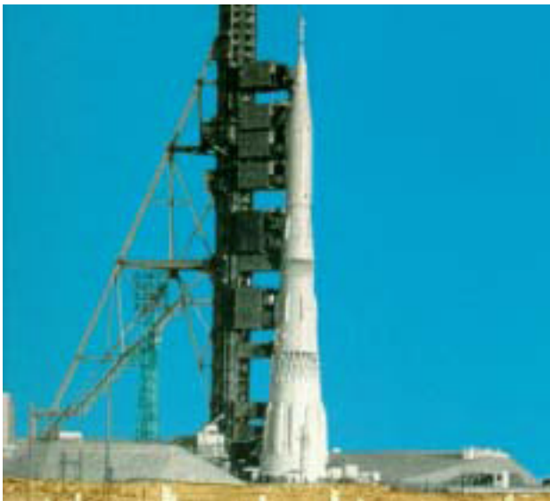
7L The last launch of the N-1.

In November 1972, the Soviets made one last attempt to launch the N-1. The space race had long since been decided and Apollo 17 would conclude the Apollo program one month later. The Soviets continued in their efforts largely due to the inertia and independent nature of the major space design bureaus. There were vague hopes that a successful launch could result in a moon landing by 1975 and a larger moon colony by 1980. There were even grandiose concepts that the N-1 would lead to an expedition to Mars.