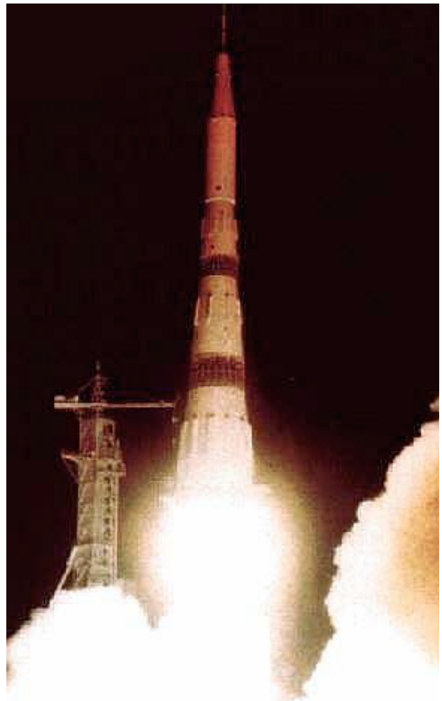
The second N-1 exploded seconds after its launch on July 3, 1969.

engine 2 broke off from their mounts starting a fire in the first stage. All the engines were shut off by the automatic KORD engine control system 68.7 seconds after launch. At 70 seconds after the launch the N-1 was destroyed by the range safety officer.