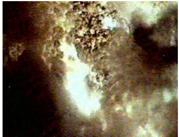
Explosion resulting from the failure of the second N-1

The Soviets were not daunted by the fiery explosion of the N-1, and made one last gasp in the moon race. Although it was impossible to make a manned landing it still was hoped that an automated probe could return lunar samples before Apollo 11 splashed down. On July 10th the Soviets launched the unmanned Luna 15 which would obtain soil samples and launch a smaller satellite returning several hundred grams of moon rock to earth. The launch was successful and Luna 15 actually was orbiting the moon at the same time as Apollo 11. Luna 15 failed during its descent and crashed into the moon two days before Neil Armstrong placed the first foot steps on the moon.