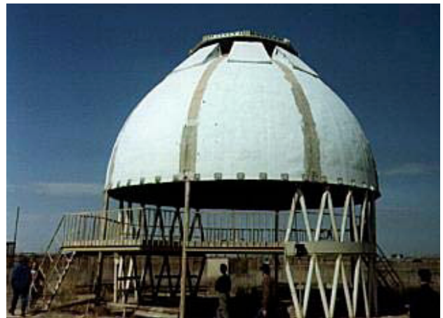
Part of N-1 propellant tank now used as a gazebo in Baikonur.

Despite Glushko's orders some mammoth parts of the N-1 survived, though in most unusual ways. Part of a tank assembly became a gazebo and a third stage a storage shed. These few rusting parts still stand as a symbol of the N-1 program in the section of the Kazakstan desert composing the Baikonur Cosmodrome.