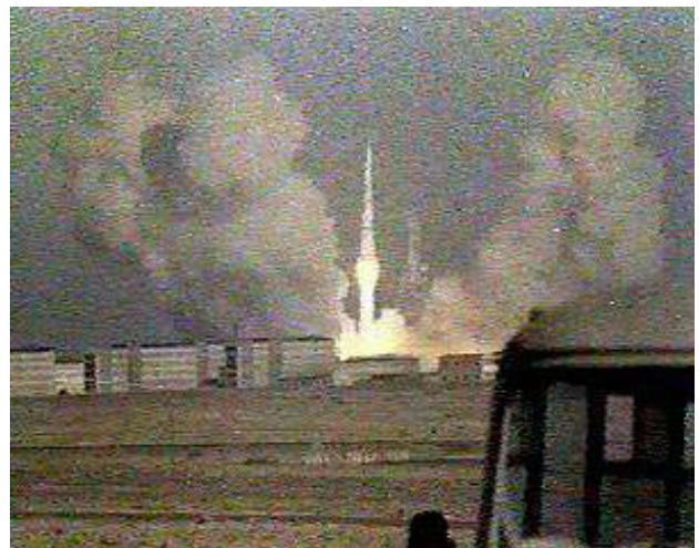
7-L rises over apartment blocks at Baikonur prior to exploding.

The fourth time would be as disappointing as the other attempts. On November 23, 1972 the thirty engines ignited once again and the first stage performed better than on other occasions. The first stage was nearing its burnout and the second stage was almost scheduled to ignite. At 107 seconds into the flight excessive turbulence within the propellant lines lead to a rupture and then a fire in engine number 4. Again the N-1 was destroyed by the range safety officer. This failure was especially disappointing since the first stage was nearly empty. If the second stage had been capable of being ignited manually, it could have carried the rest of the N-1 away from the first stage and possibly to a successful flight. On its last flight the N-1 flew further and faster than its predecessors until it exploded 125 kilometers downrange.